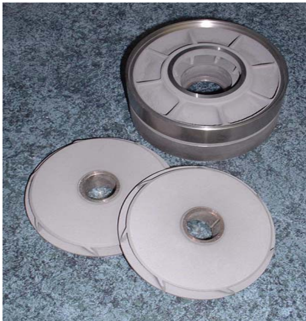
CORROLON C-2000™ (prior to fluoropolymer top coat) applied evenly to pancake pump stages in Centrilift - California (Huntington Beach) for use in extreme sand wells.

In environments where corrosion protection is important, process equipment and function-to-success parts are enhanced by reducing oxidization, fretting (vibration), galvanic corrosion, and increasing chemical resistance.