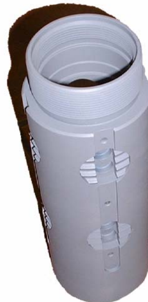
CORROLON C-2000™ is applied to oilfield packer pieces for Baker Oil Tools in order to "Frac" Harden parts for aggressive environments with severe abrasion and hostile temperatures.