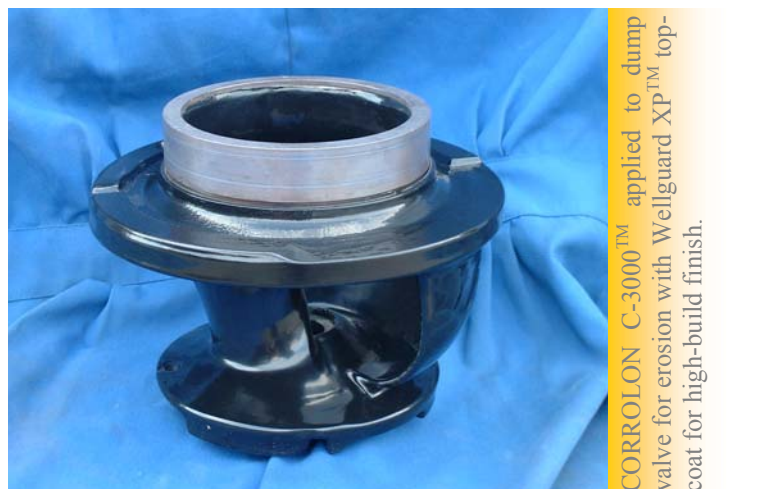
CORROLON C-3000™ applied to dump valve for erosion with Wellguard XP™ top-coat for high-build finish.

The unique structure of the surface layer of CORROLON C-3000™ inhibits welding, avoids metal transfer and results in high residual compression stresses.